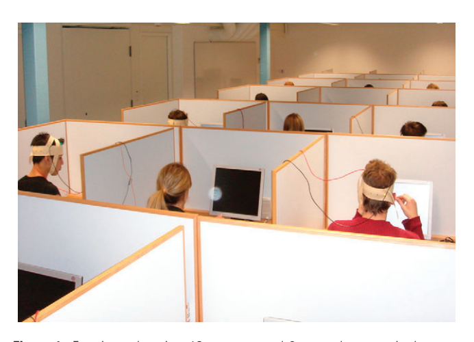
Figure 1. Experimental setting: 12 proposers and 6 responders were in the same laboratory during an experimental session. Responders received tDCS (placebo or cathodal stimulation over the right DLPFC), whereas experimenters sat between each pair of responders to control the tDCS devices.

We conducted the tDCS study with 128 subjects in the role of the proposer (no tDCS) and 64 subjects (all right-handed men) in the role of the responder who received either cathodal (i.e., excitability reducing) tDCS (n = 30) or placebo tDCS (n = 34) to the right DLPFC. During an experimental session (Fig. 1), 6 responders played 12 UGs each with 12 different, anonymous, proposers, that is, each responder "faced" any given proposer only once and was never informed of the bargaining partner's identity. We deliberately chose 1-shot interactions because no strategic spillovers across periods occur with this structure. This is particularly important if "true" preferences are to be elicited. We can therefore rule out the possibility that the observed rTMS effect is due to induced ignorance of possible reputational effects. The responders had to agree on the division of 20 Swiss Francs (CHF; CHF 1 \approx \in 0.65 ).